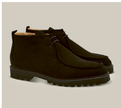
TOURING Hydro-suede, Umbra, Oscar Last S.228-VWU.OH-HS

For an architect who spends long days transitioning from site visits, client meetings and lectures, the Oscar last on our timeless Touring model provides the comfort and space to breathe – and think deep thoughts.