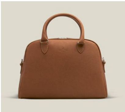
PHILADELPHIA Country Calf, Cognac N.T601-GPC

Whether walking in the footsteps of past explorers or navigating time in an ever-changing world, Ludwig Reiter is dedicated to crafting accessories that accompany your story.