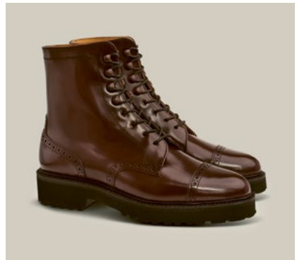
MARY VETSERÄ Calf Spazzolato, Bordeaux, Viennese Last S.88-RCW.DWF-2-DS