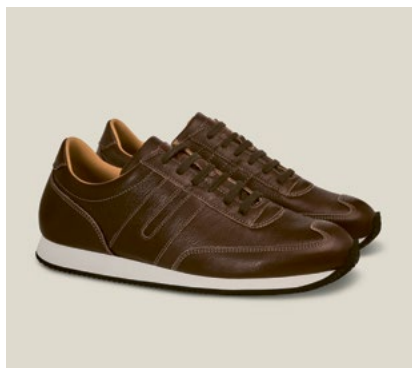
MARATHON Limited Edition Sportcalf, Chestnut T.523-BFK

The long journey from harvest to bottle is unique in the culinary world, like a marathon, its distillate's require patience and character to complete the course. This season we have spent some extra time acquiring the finest sports-calf leather for our Marathon trainer, naturing refined qualities in our athletics.