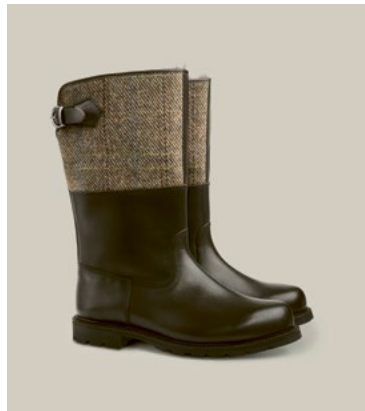
MARONIBRATER Tweed / Bark Tanned leather, Moss Green / Mocca, Kitzmantel Last S.592-D-TWI

The iconic Maronibrater, our elegant winter boot, epitomises a harmonious blend of style and functionality using sustainable natural materials. Our new addition sports an Tweed shaft, adding a warm and durable woolen detail that celebrates the British pastime of walking with ones furry friend. These boots effortlessly transition from countryside strolls to urban explorations, embodying the essence of British elegance and practicality, making them an essential accessory for the mindful wanderer.