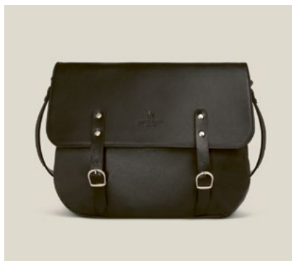
COLPORTAGE Sport Nappa Calf, Saddle Leather, Black N.T692-NCS

Shouldering knowledge and responsibility is familiar to Ludwig Reiter, where traditional craft and sustainable practice is paramount. Our Colportage shoulder bag combines the finest Sports Nappa and Saddle leathers in a minimalistic construction, creating a uniquely elegant model and a testament to those enterprising 'Reiters' who moved knowledge across our borders.