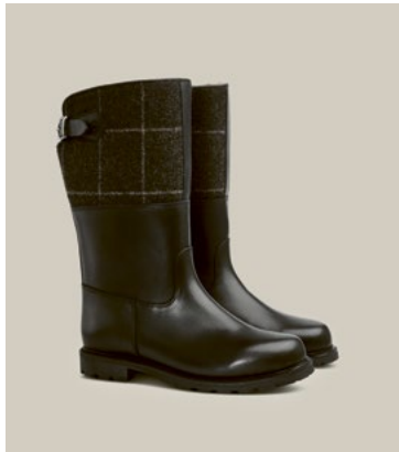
MARONIBRATER Tweed / Bark-tanned leather, Umbra / Black, Kitzmantel Last S.892-S-TWU

At Ludwig Reiter, we celebrate such connections. This season's Maronibrater boot features a Tweed upper, crafted from the highest quality wool from the Scottish borders and bark-tanned leather. Each pair is meticulously handmade to offer unparalleled comfort and endurance. Just like the bond between horse and rider is forged in nature, our boots create a seamless link between wearer and environment, ensuring every step is taken with grace and confidence.