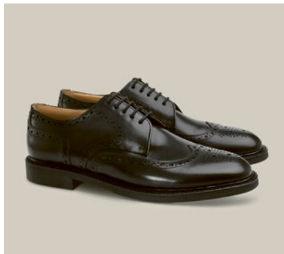
BUDAPESTER Boxcalf Leather, Black, Oscar Last R.16-BCS.OH-2Z-JS

The Budapest is the Viennese version of the English full brogue, and like the Viennese its elegant, adaptable yet a little restrained. We've adapted this last characteristic to allow for a little more amplitude, with the addition of our new spacious Oscar last. It's wider profile accommodates for active feet and an additional insole, whilst retaining the Budapest's timeless silhouette. Let your feet walk with peace of mind.