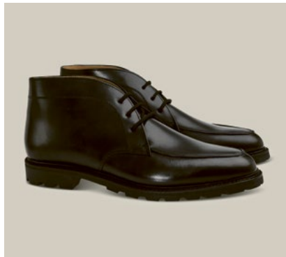
GRÖBMINGER Vintage Pullup, Black, Tuscan Last R.69-RPS.TGS-2Z-GJ

Our Gröbminger vintage Pullup, with an all weather Goodyear-welted sole, is a homage to this ensemble – a dance of practicality and sophistication, where form embraces function in a timeless ballet.