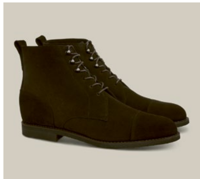
HUNTING BOOT Hydro-suede, Umbra, Tuscan Last R 74-VWU.TGS-2-KS