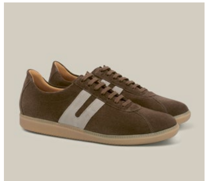
TRAINER Suede, Safari / Quarz T_512-VLJ-VTQ_C