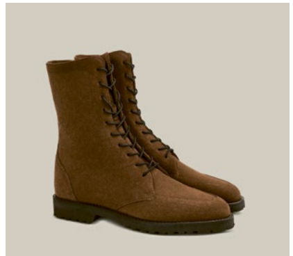
FANNY Hydro-suede, Maroon, Tuscan Last S 884-VWM.DTR-ES